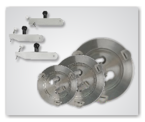
Properly Secure Blades and Accurate Steeling: There is a blade holder and steel for each type and size of blade.