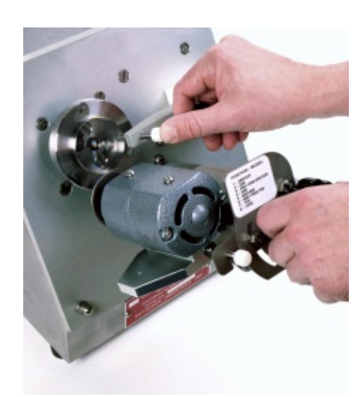
Simple, straight forward design makes it easy to restore any Whizard Trimmer blade to its factory sharp edge.