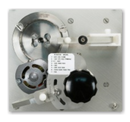
Simple Sharpening Wheel Adjustments: Simple instructions for proper wheel setting for each blade eliminates guesswork.