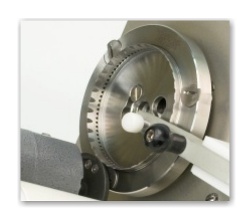
Precision Sharpening Wheel: Correctly sharpens all Whizard blade types, never needs dressing and outlasts other sharpening stones.