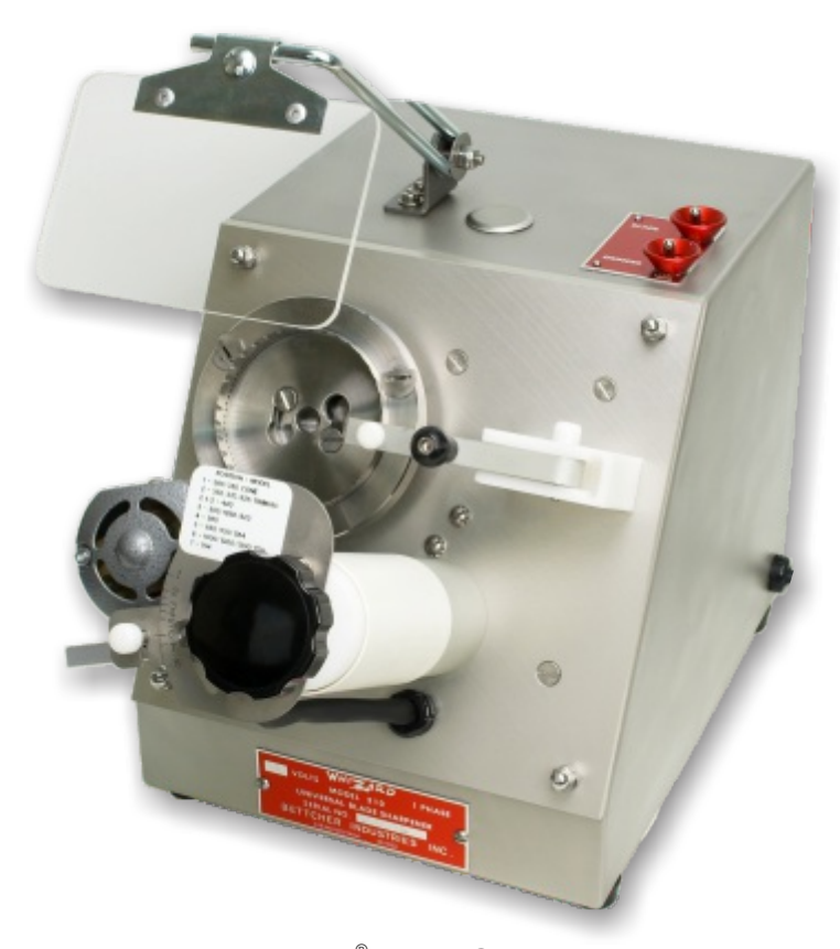
Universal Whizard<sup>®</sup> Blade Sharpener shown with optional blade holder and a serrated blade.

The blade is held firmly in place so the sharpening wheel and steel can precisely duplicate the original factory edge. There's never any guesswork. Your maintenance department will sharpen Whizard blades, including TrimVac blades, with greater speed and accuracy than ever before!